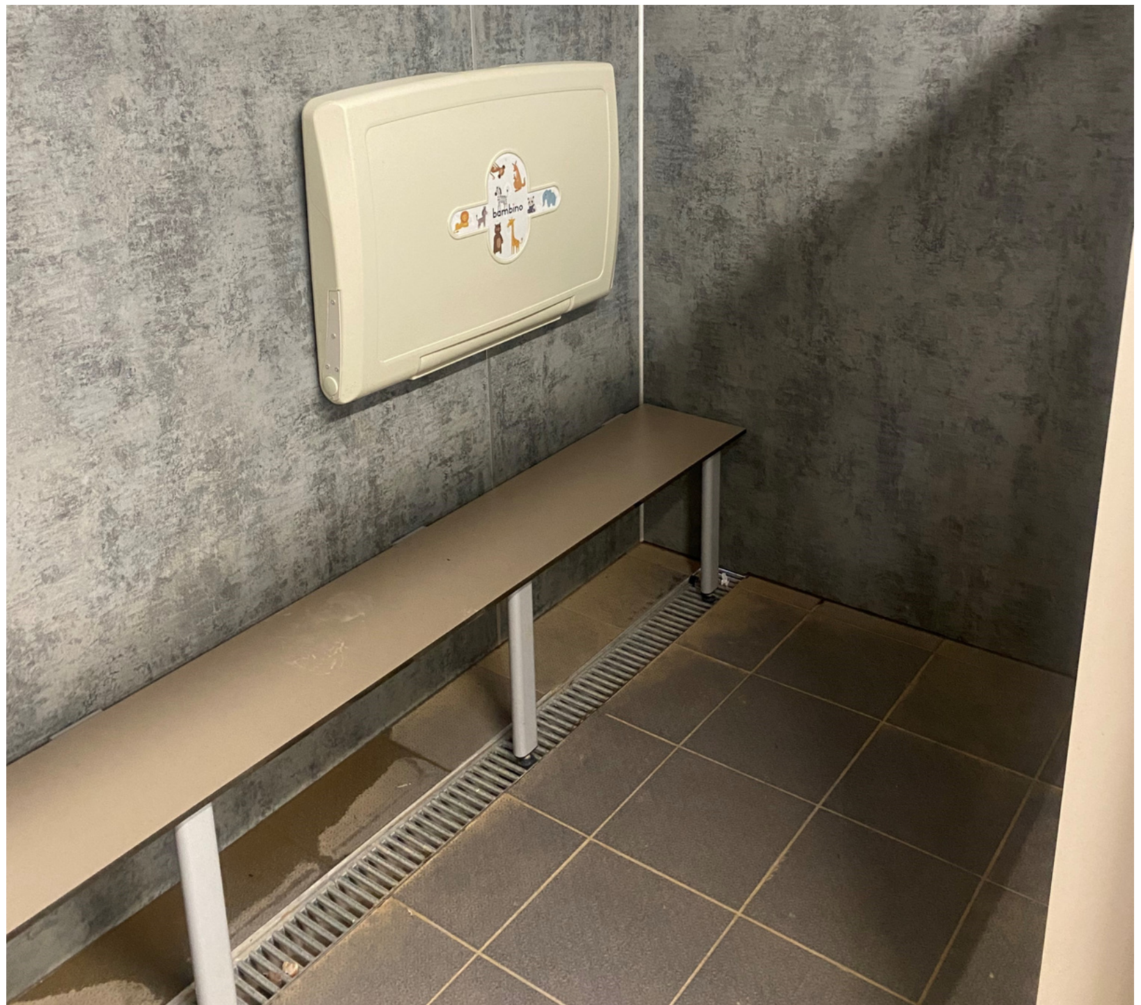
Inside Accessible Changing Room