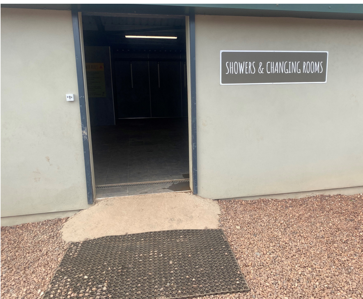
Amenities Block Entrance