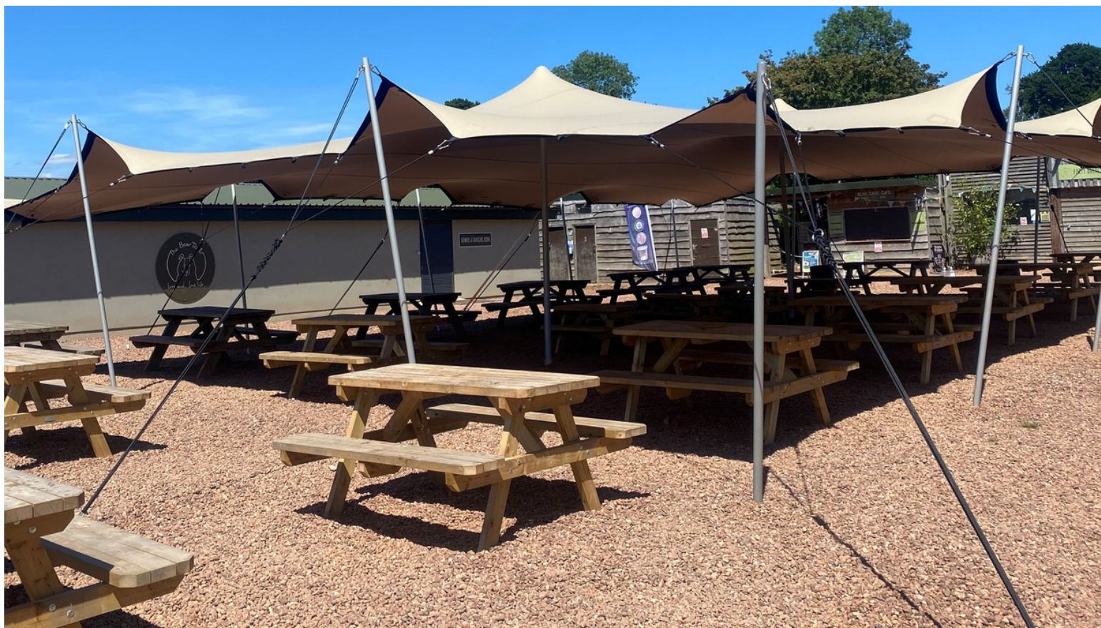
Outdoor Picnic Area