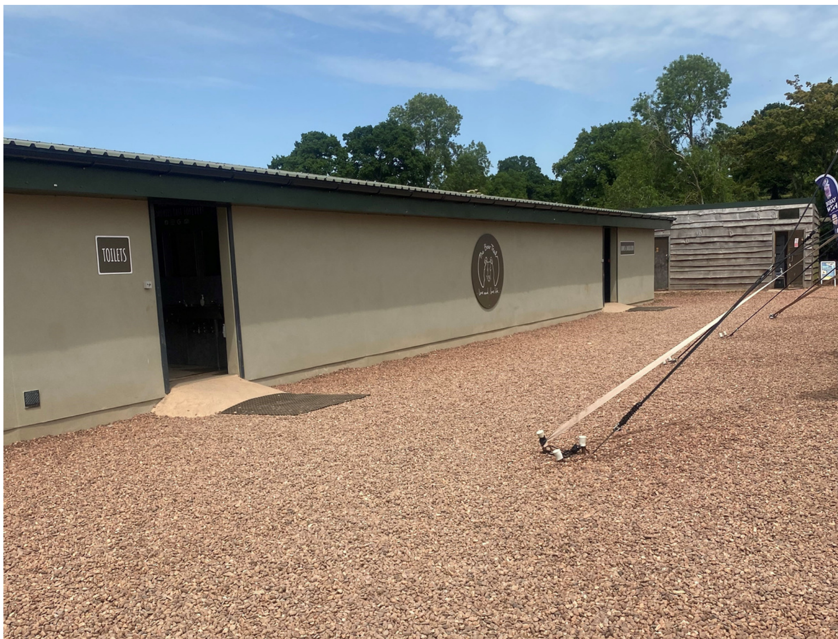
Access To Amenities Block Terrain