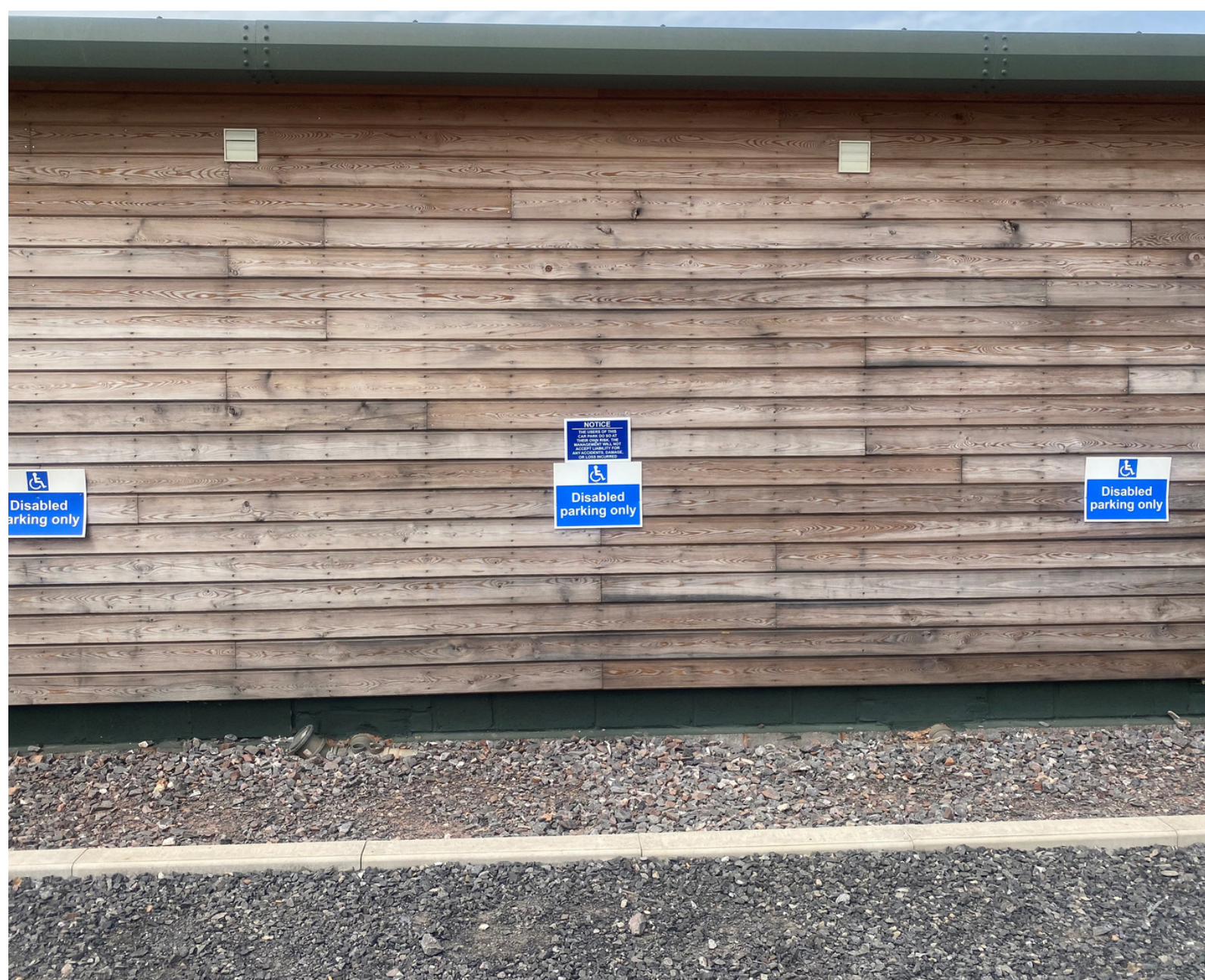
Accessible Parking Signs