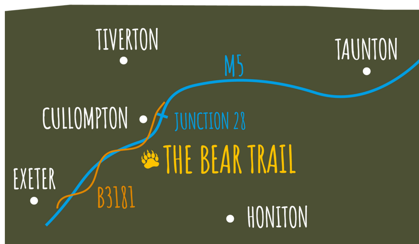
The Bear Trail Location