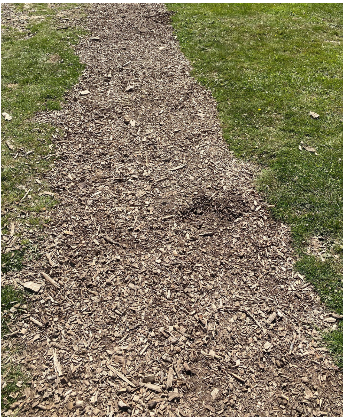
Path Around The Course