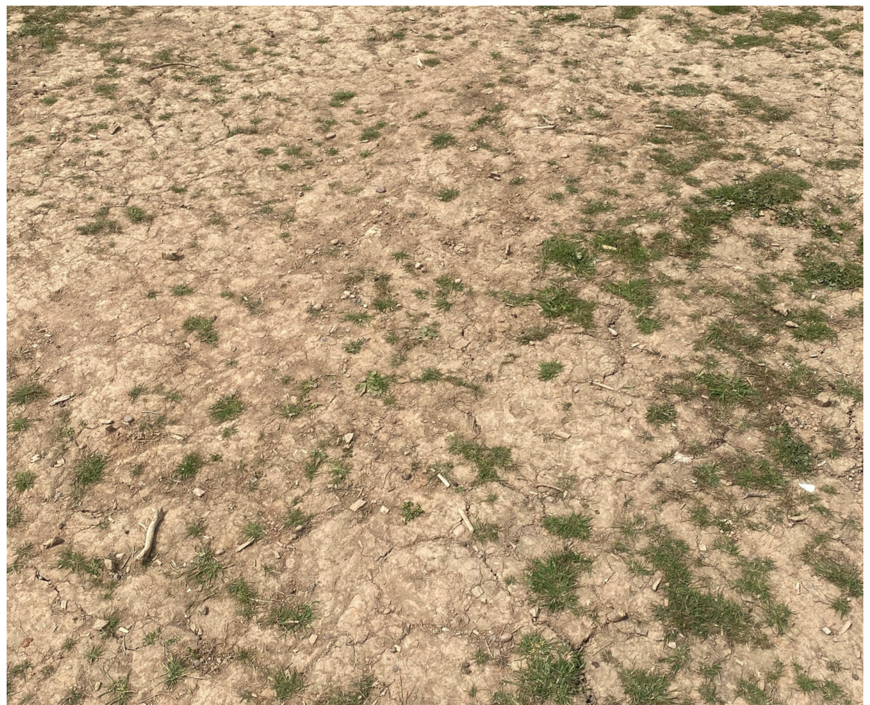
Uneven Ground Around The Course