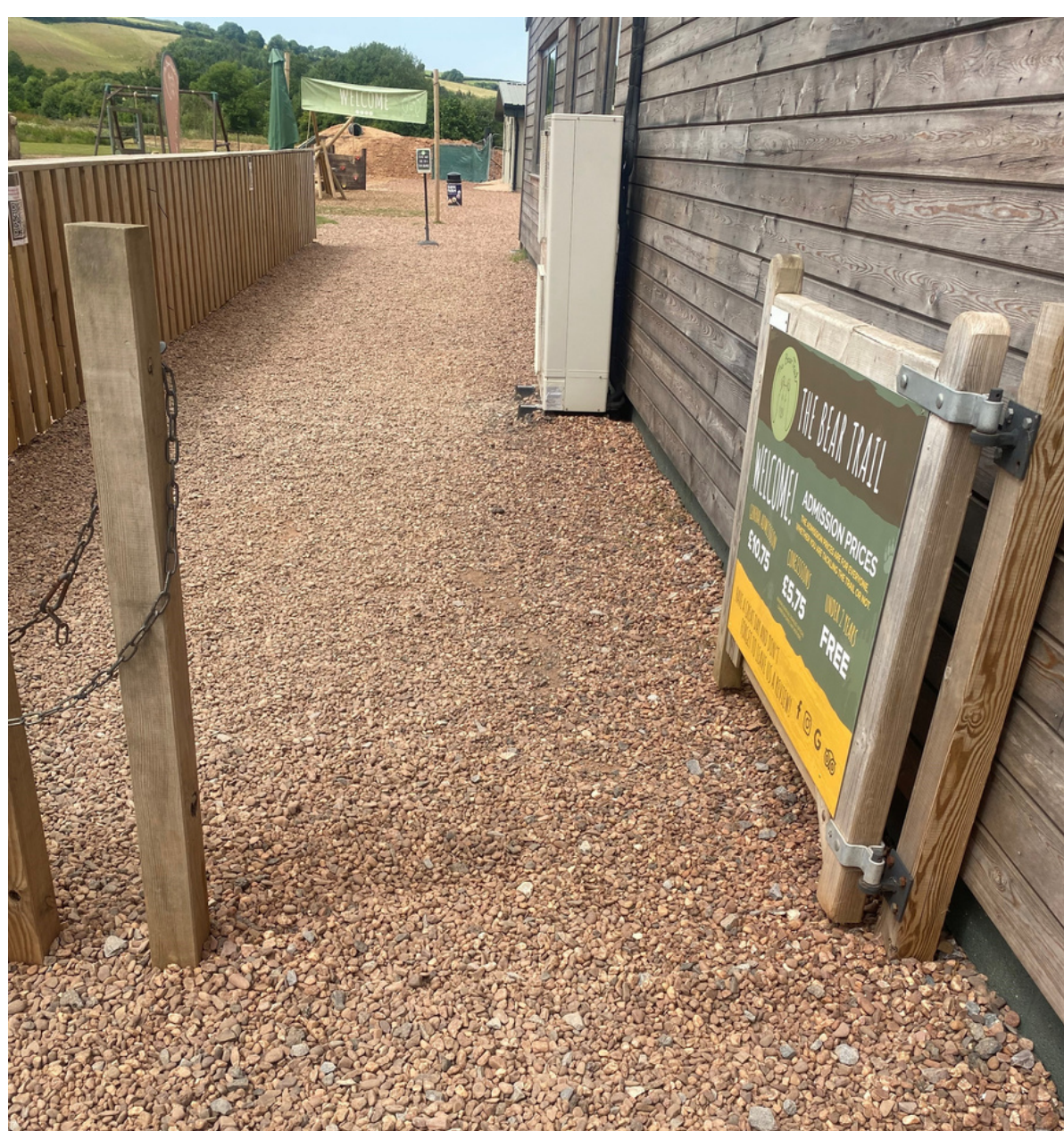
Accessible Entrance Gate Open