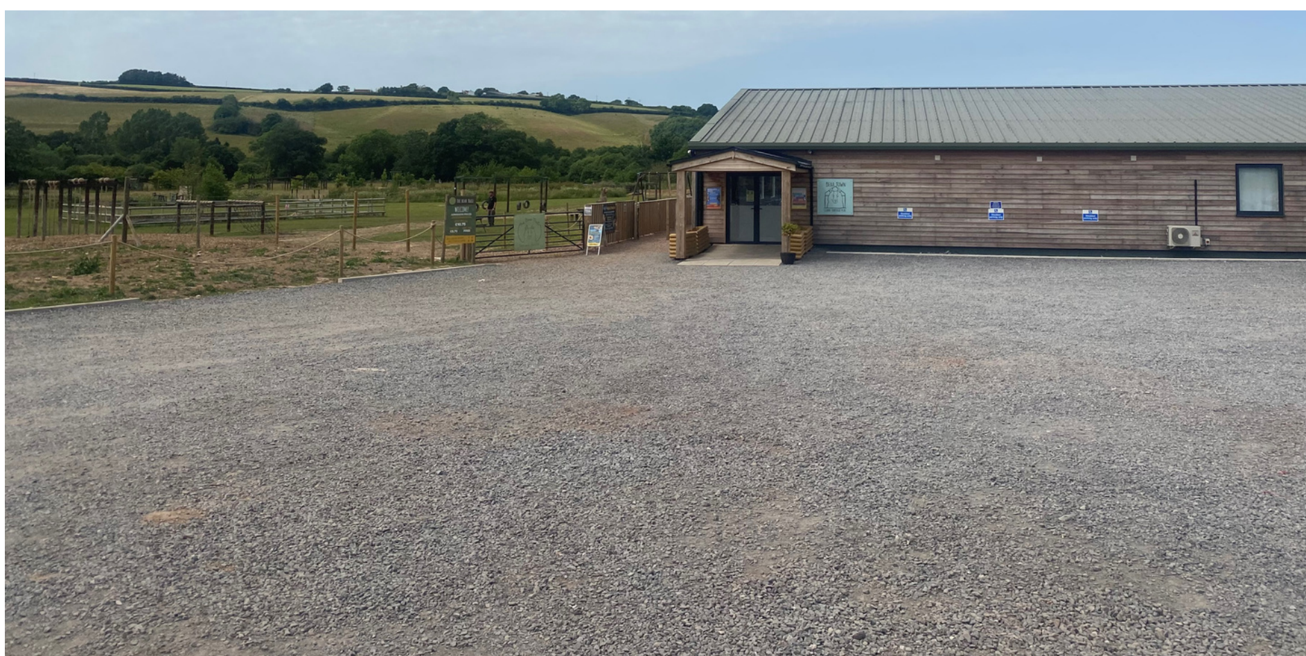
The Bear Trail Car park