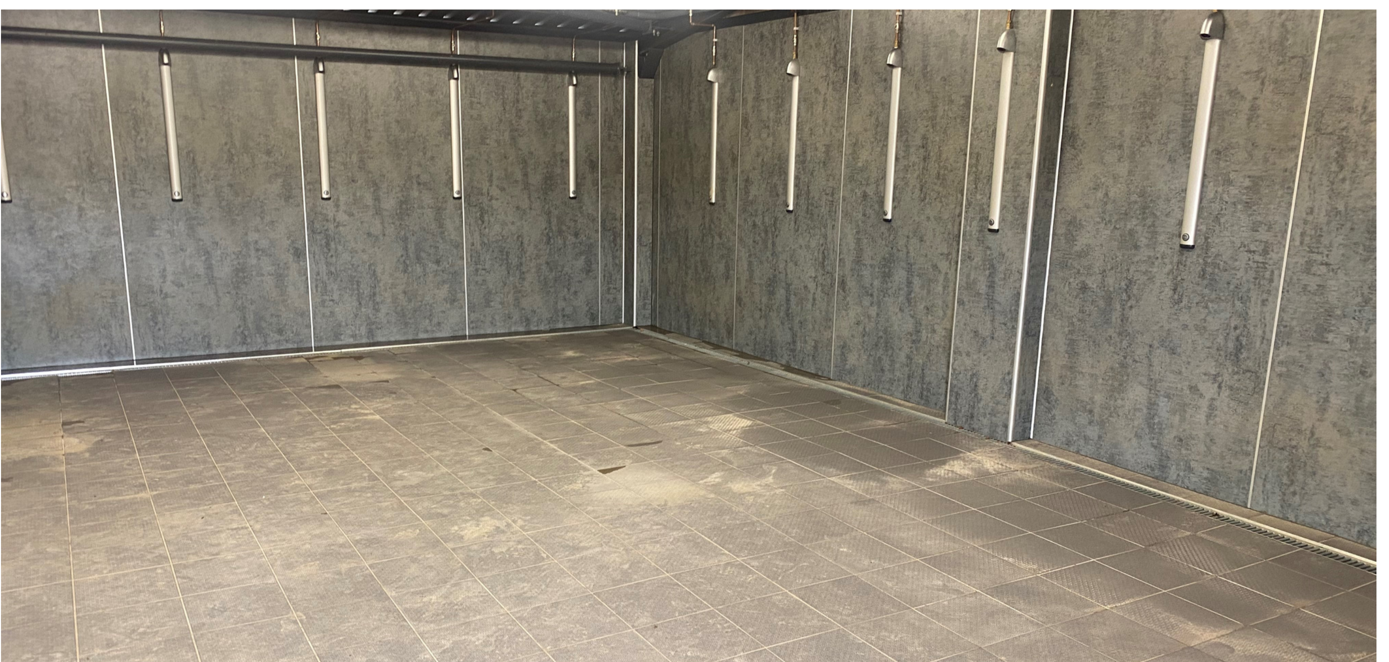
Rinse Off Area