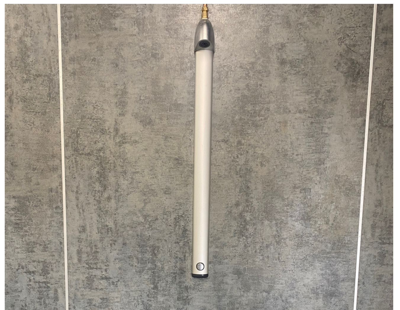
Each Shower Head