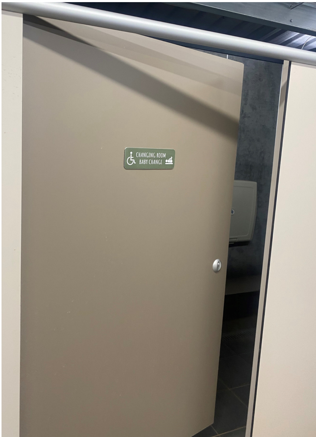
Accessible Changing Room Door