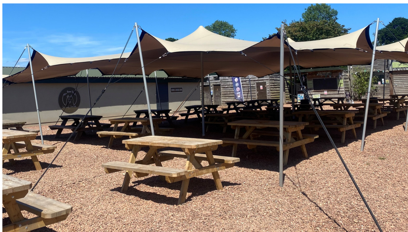
Outdoor Picnic Area