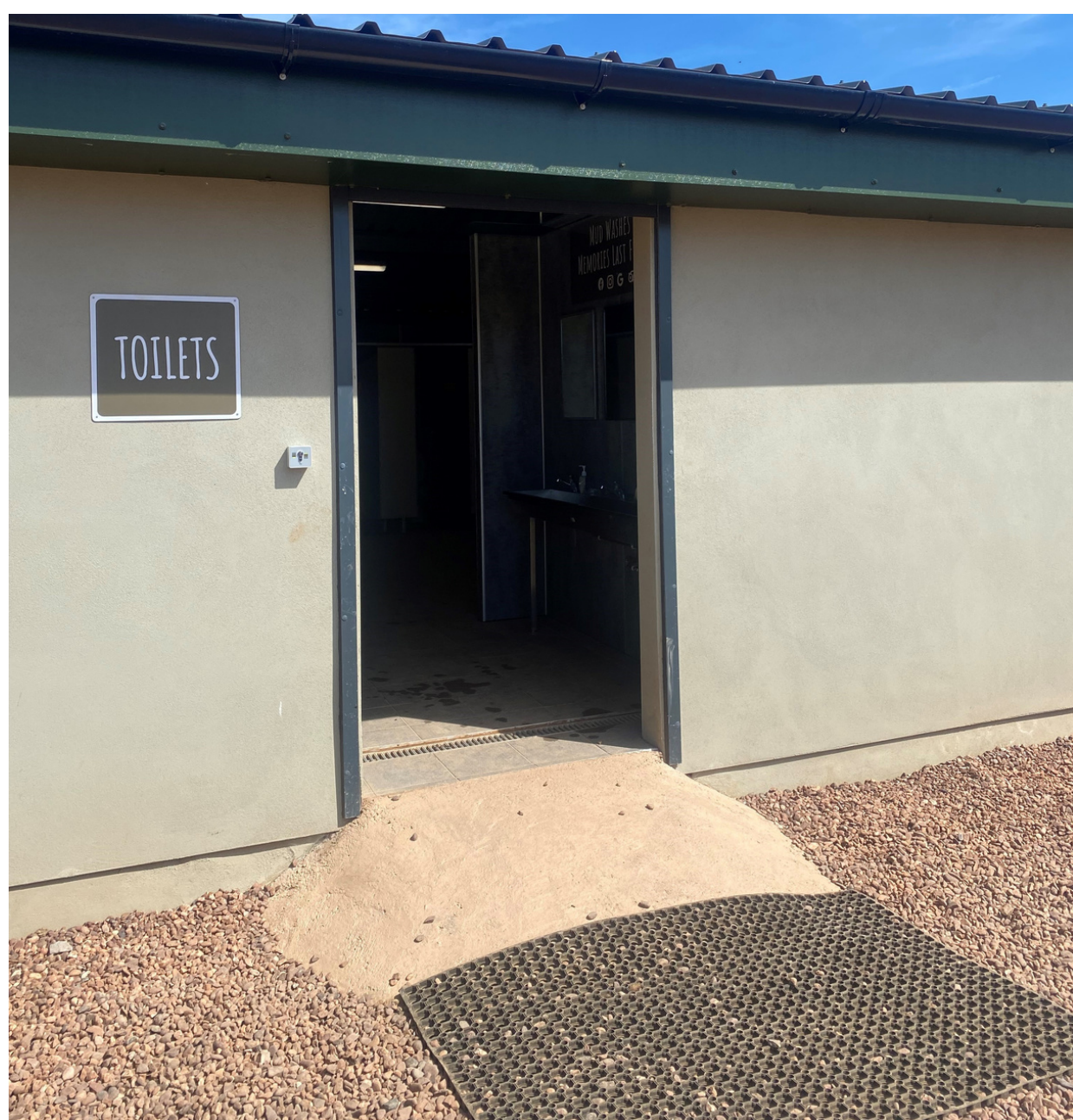
Amenities Block Entrance