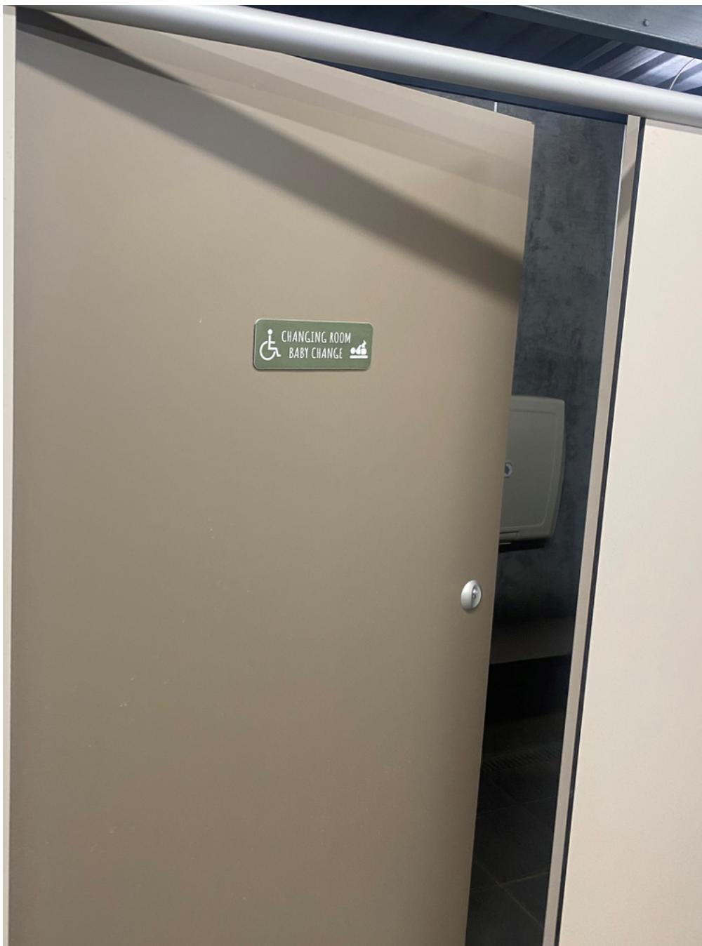
Accessible Toilet Door