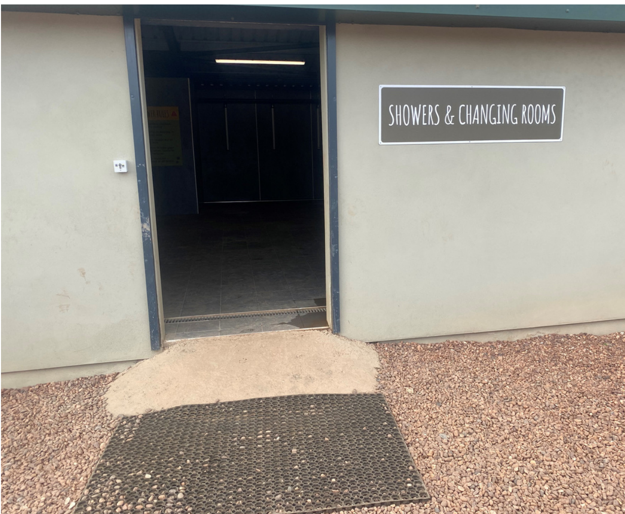
Amenities Block Entrance