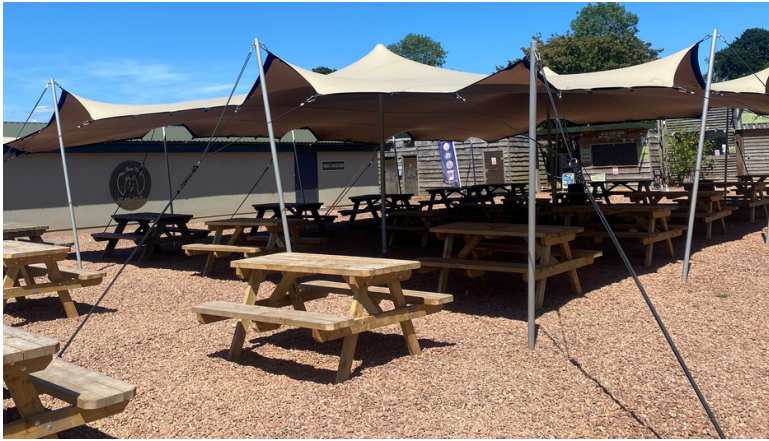
Outdoor Picnic Area