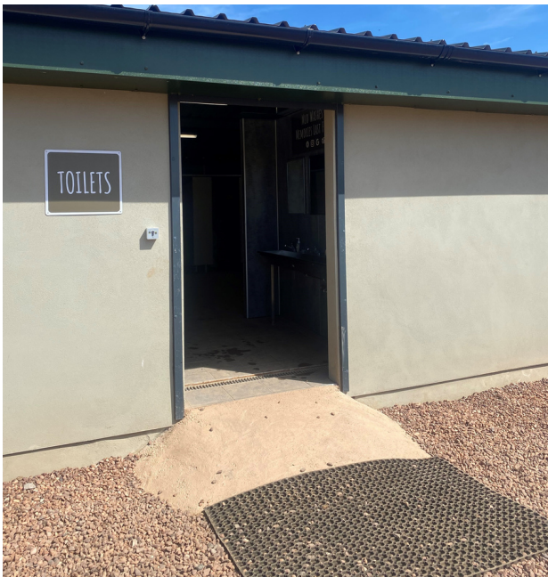
Amenities Block Entrance