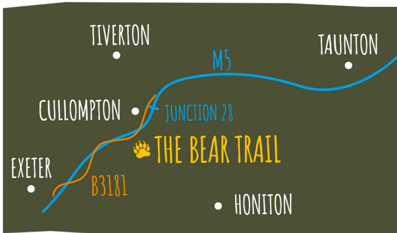
The Bear Trail Location