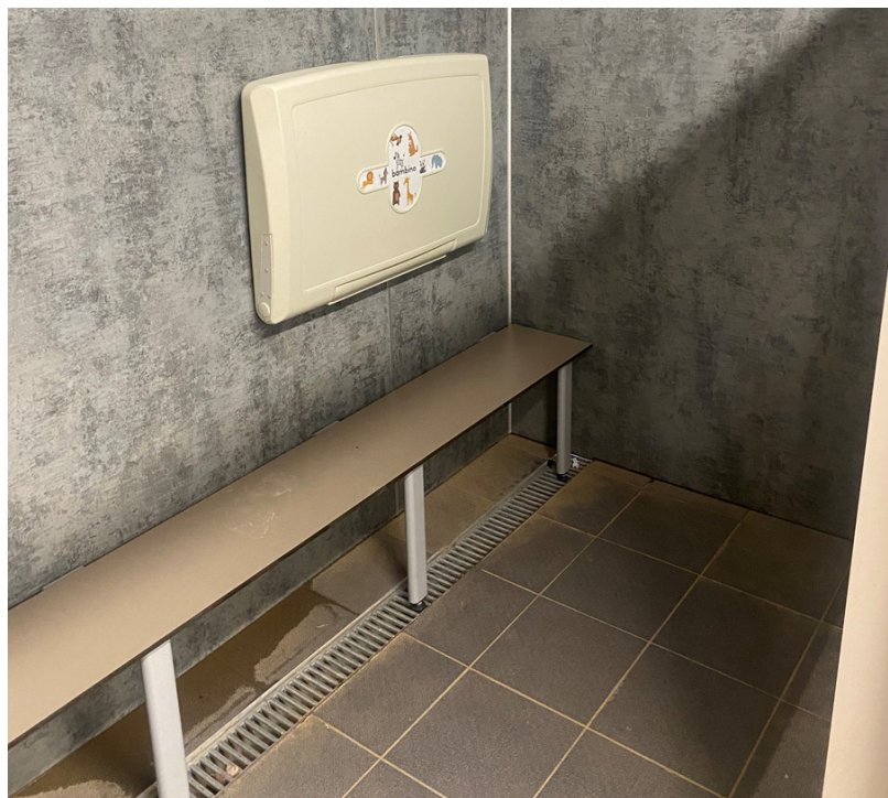
Inside Accessible Changing Room