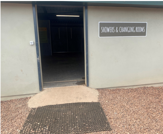
Amenities Block Entrance